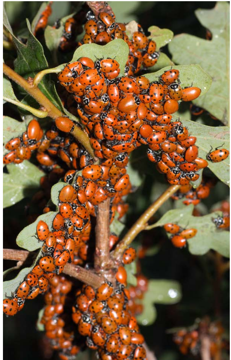
So many bugs!