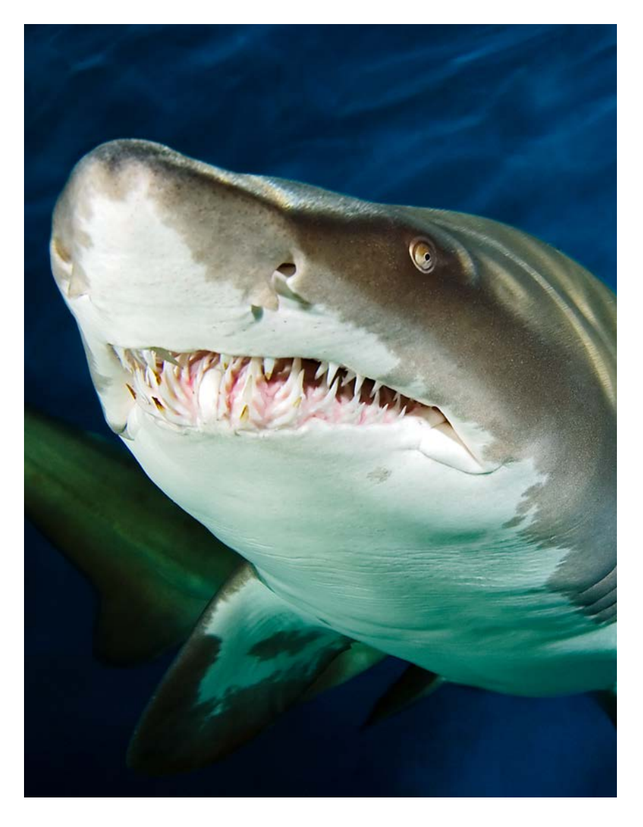
A sand tiger shark can have ninety-six teeth.