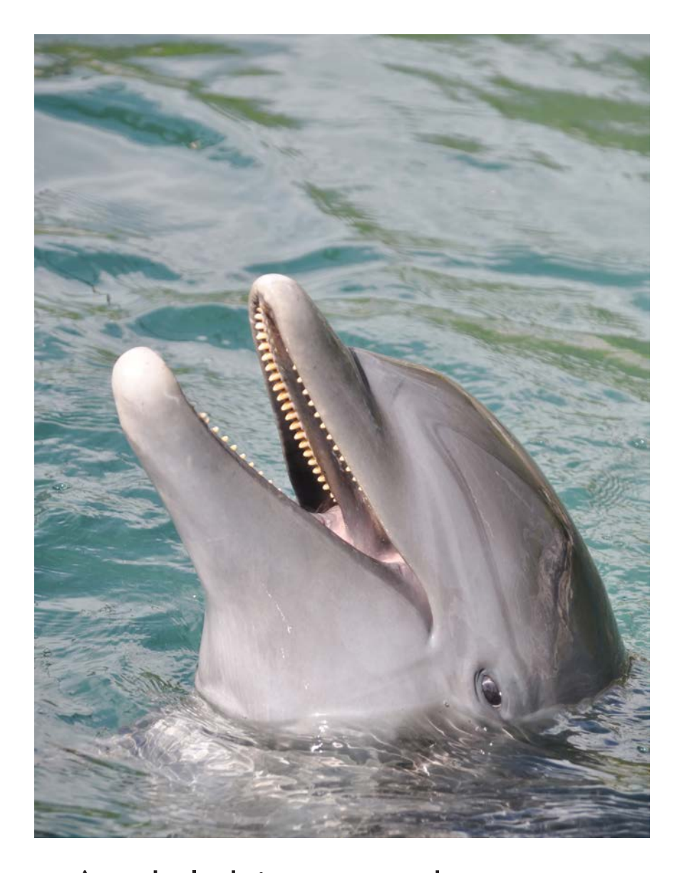
A dolphin can have two hundred fifty teeth.