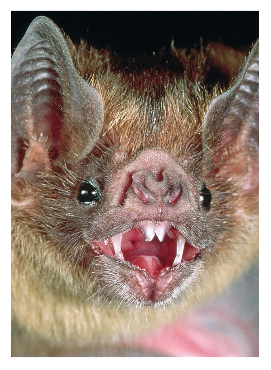
A vampire bat can have twenty teeth.