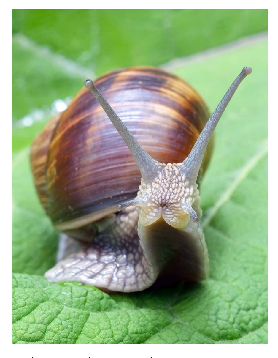
A snail can have twenty-five thousand teeth!