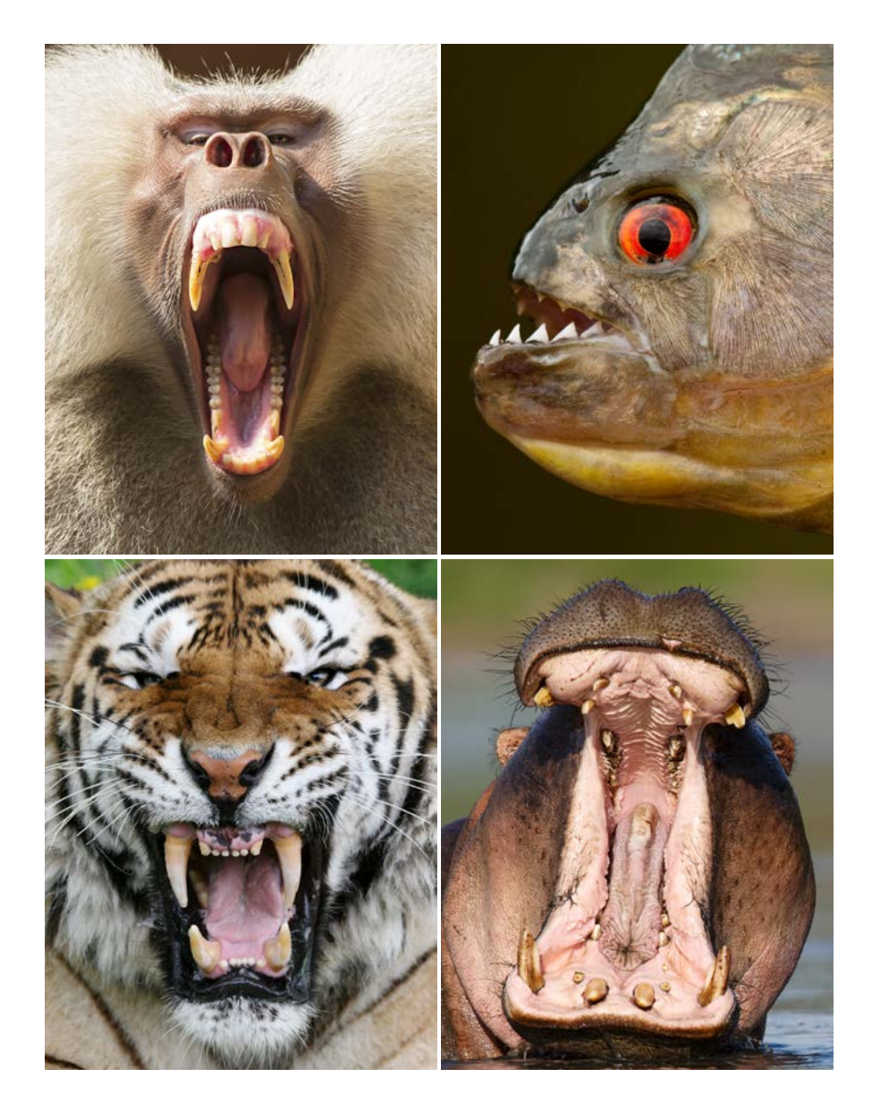
Different animals have different numbers of teeth.