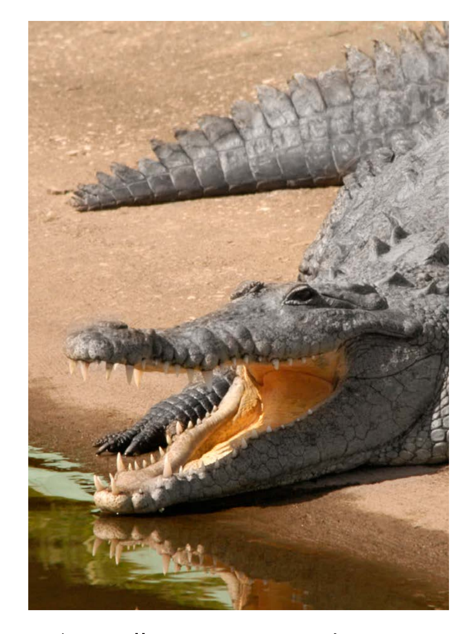
An alligator can have eighty teeth.