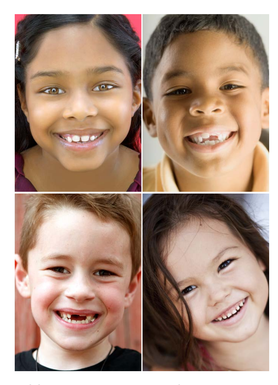
How many teeth do you have?