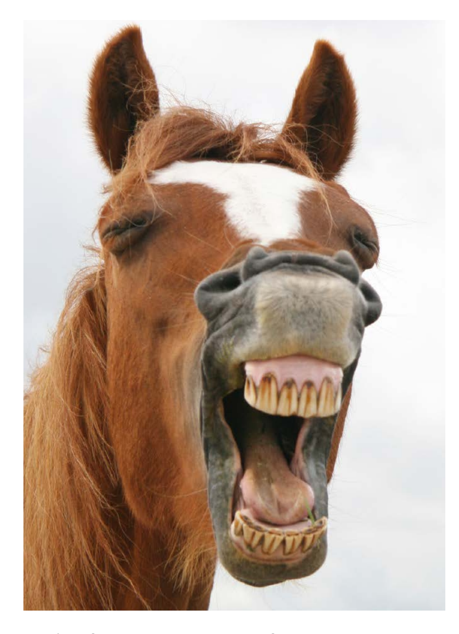
A horse can have forty teeth.